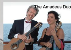
The Amadeus Duo